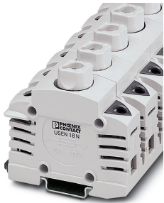
Fuse terminal blocks for NEOZED fuse inserts

Please be informed that the data shown in this PDF Document is generated from our Online Catalog. Please find the complete data in the user's documentation. Our General Terms of Use for Downloads are valid ( http://phoenixcontact.com/download )